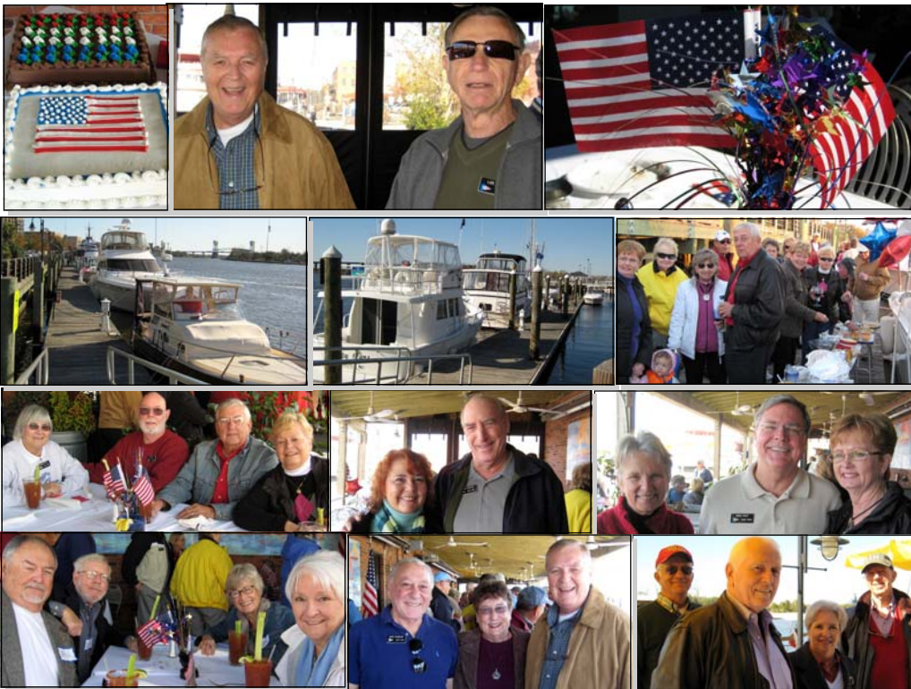
Pictures from November Meeting, Veterans Day Recognition Cruise and Rendezvous In Downtown Wilmington

The event finished up with birthday cake and a brief presentation about the Squadron's rich nautical history and some remarks about the Cape Fear Sail and Power Squadron burgee. #